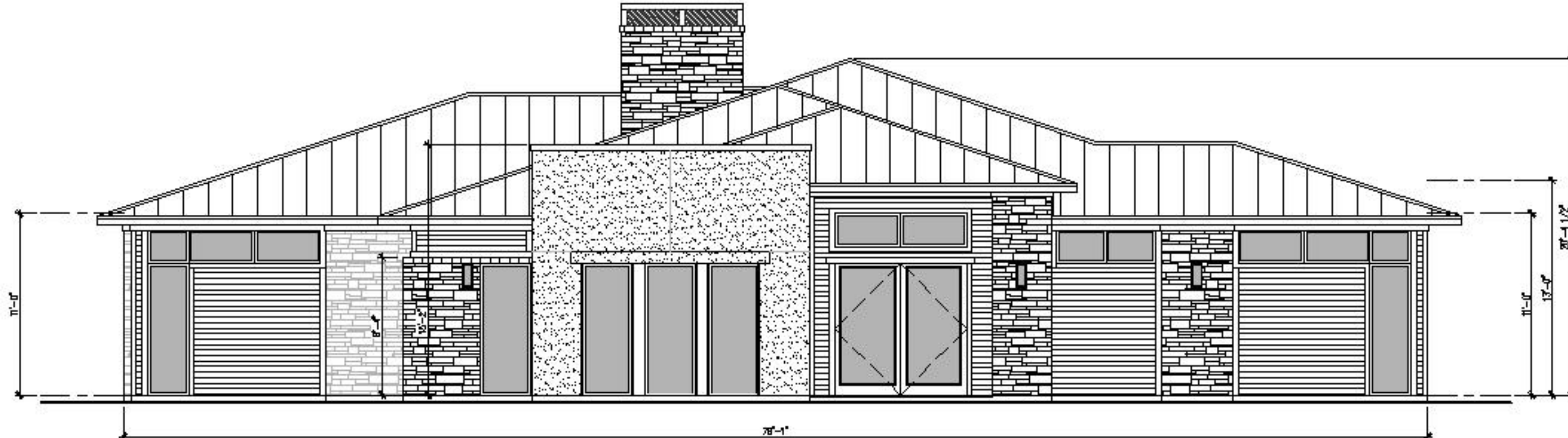
FRONT ELEVATION - B

SCALE: 1/4" = 1'-0" ON 12x18 PAPER SCALE: 1/4" = 1'-0" ON 24x36 PAPER