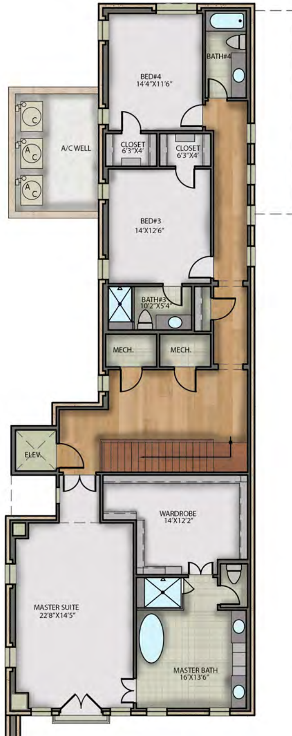
ENTRADA E-BLOCK-1 2ND FLOOR

Plan E1 | 3 Bedroom | 3.2Bath | 2 Car Garage | 4,528 sq. ft.